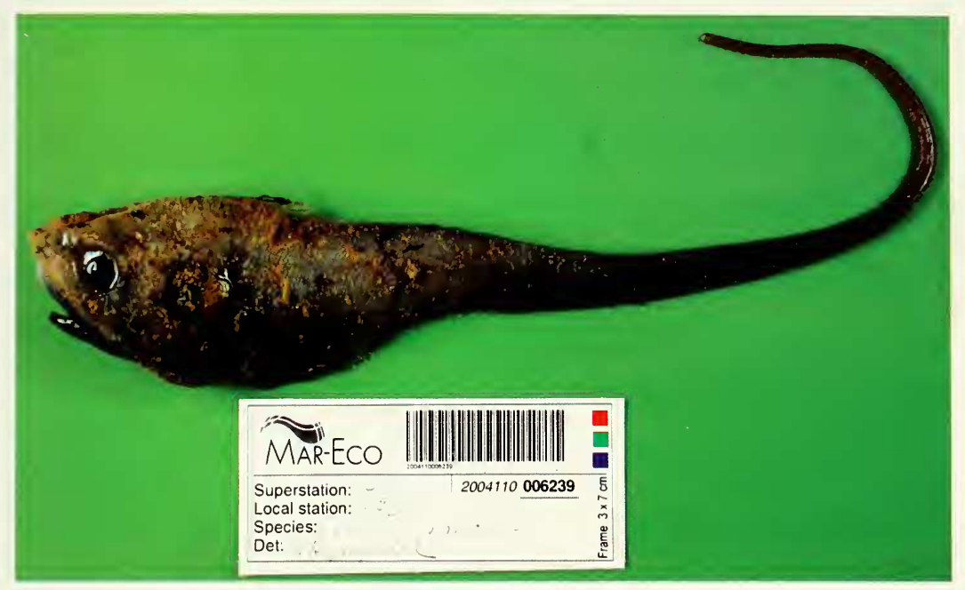
FIGURE 1. Paracetonurus flagellicauda, ZMUB 16357, from the Mid-Atlantic Ridge in the North Atlantic at a depth of 3050–3005 m.